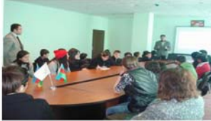
Lənkəran Gənclər Evinə Dəyirmə-masə

MAGİYA ictimai birliyinə tərəfdaş təşkilatların şagird və müəllim heyəti üçün keçirdiyi müxtəlif tədbirlər