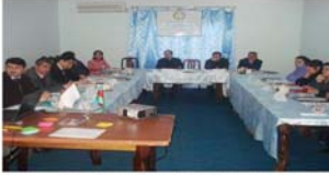
Dalğa otelində tərəfdaş təşkilatlar üçün görüş

“Maarifpərvərlik” Azərbaycan Gənclərinin İctimai Yardım Assosiasiyası (MAGİYA) ictimai birliyi