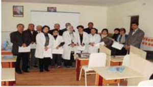
Uşaq evində təlim kursu